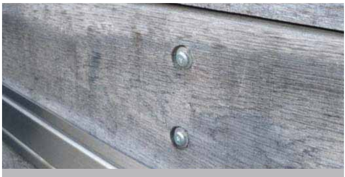
Screw fixing of hardwood cladding

Annular ring shank nails (sometimes called improved nails) only require point-side penetration of 2x the board thickness. For example, 40mm of nail penetration for a 20mm thickness board using 60mm length nails. Two nails are normally used at quarter points across the width of the board.